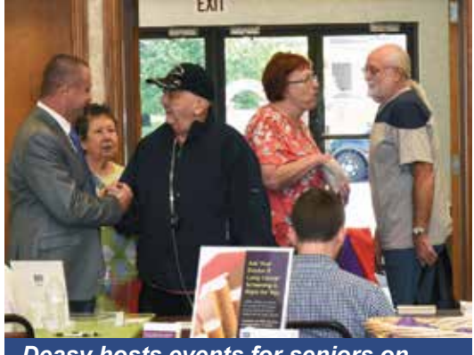
Deasy hosts events for seniors on state programs/services.

assessed at a higher value or if the millage rate is increased. I often hear from seniors about the struggles they face in paying property taxes on a fixed income, especially when they have rising out-of-pocket